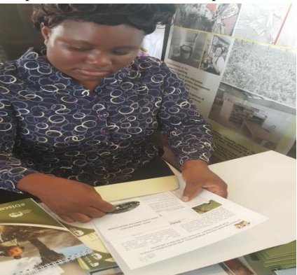
Packaging of information materials for distribution