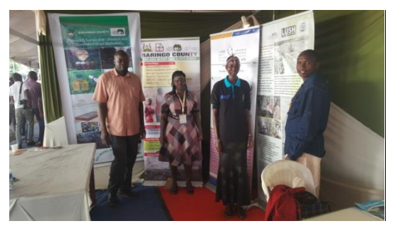
The Three community groups