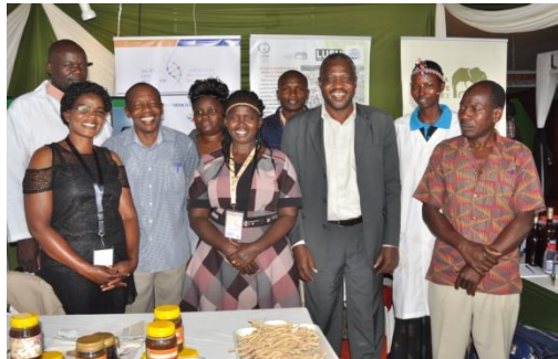
ABS Partnership model exhibitors