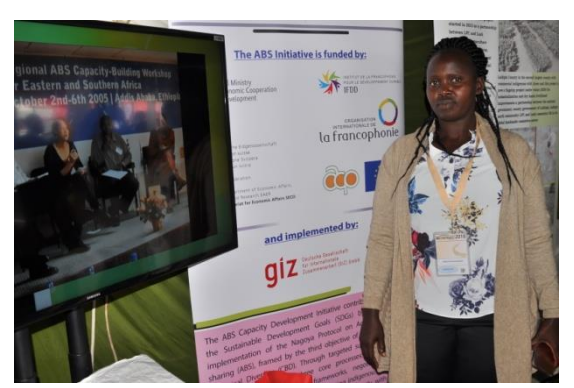
ABS film documentaries and banner