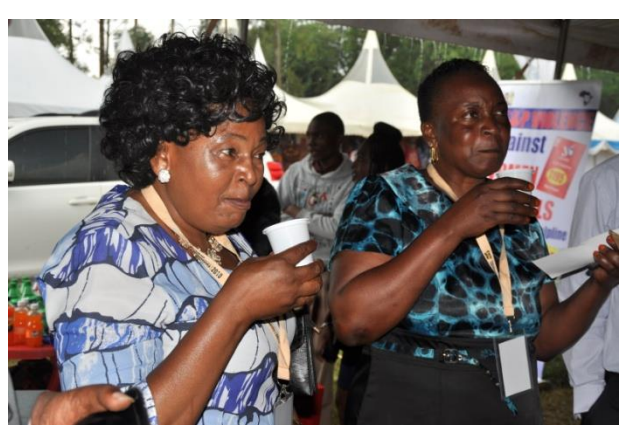
Kakamega County Assembly members keen on ABS Model