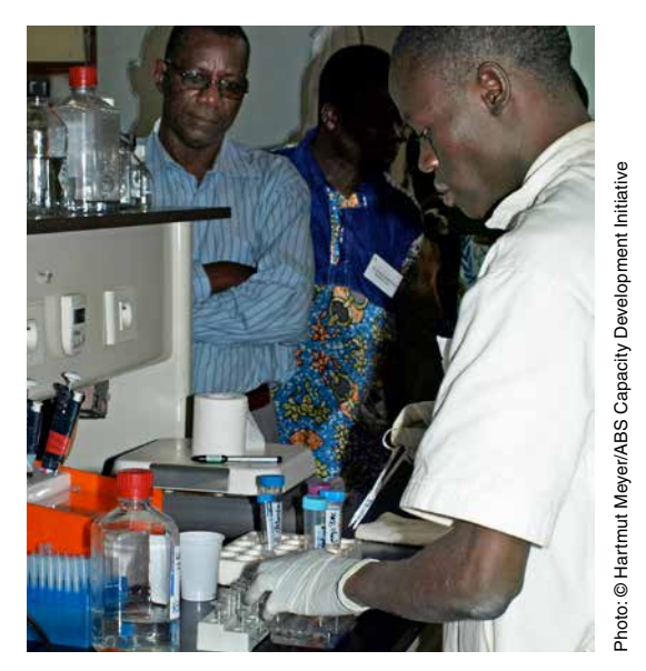
A biotechnology laboratory in Mali.

In line with international rules, the sharing of germplasm and other material increasingly takes place under material transfer agreements.<sup>59</sup> This allows organizations to share biological material such as seeds, celllines or germplasm for evaluation or further development while agreeing on terms of use for the material and information, and on any related intellectual property. However, most material transfer agreements do not address the rights of the original providers of the genetic resources to the ex-situ collections.