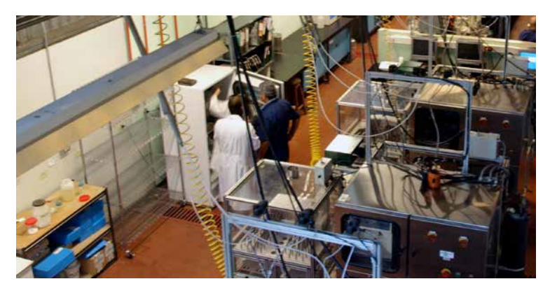
Biotechnology production facilities at INBio, Costa Rica.