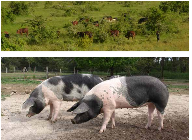
Herders and farmers in Uganda and Germany breed animals adapted to their traditional needs and uses.

Traditional knowledge that provides guidance and insights as to the properties and potential applications of genetic resources and their preservation, maintenance and use is referred to as "traditional knowledge associated with genetic resources" or "associated traditional knowledge". Interest in and understanding of genetic resources is often enhanced by its associated traditional knowledge. The CBD, though without defining such traditional knowledge, recognizes its value and role in achieving its objectives.