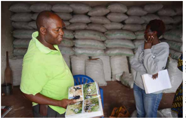
Prunus africana bark storage in Uganda.

Since the late 1960s, extracts from the bark of the Prunus africana tree have formed the basis of a drug against prostate enlargement, a condition that favours the development of prostate cancer. The raw material is mainly harvested in Cameroon, Uganda and the Democratic Republic of Congo. Three companies in the European Union now produce the extracts and medicine. Related patents have expired, and ABS contracts have never been negotiated. The Prunus value chain faces challenges in terms of sustainability. It is important that the trees grow in agroforestry schemes such as the one in Uganda pictured here, but the lack of benefit-sharing agreements with the providers of the genetic resource is a threat to sustainability. Fair and equitable benefit-sharing directed to the protection and sustainable use of the trees would support the long-term needs of all stakeholders and consumers in the value chain.