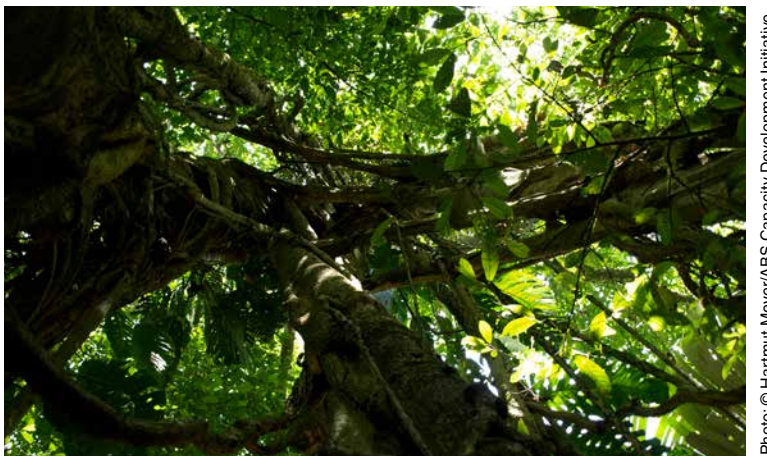
Biodiversity in Costa Rica.

For more information on the CBD, see: https://www.cbd.int