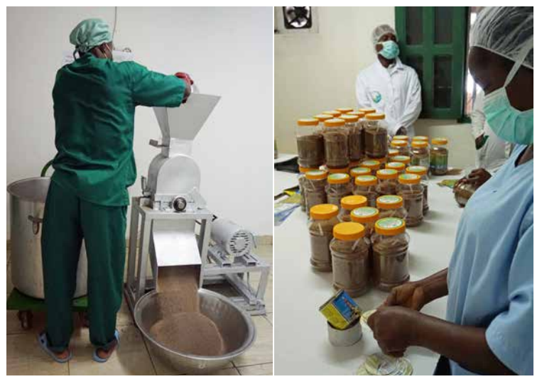
Production of functional foods by Djeka Pharmaco, Côte d'Ivoire.

Traditional knowledge often points researchers to interesting ingredients for food and beverages. Furthermore, traditional knowledge may be used to facilitate evaluations of safety and efficacy required for such ingredients. For example, under the revised Novel Food Regulation issued in the European Union in 2015, if a proposed "new" food ingredient is traditional and can be demonstrated to have been safe historically, it will not require a full assessment, but rather a notification from the food business operator.<sup>76</sup>