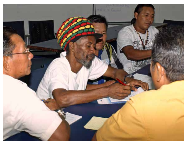
ABS training for indigenous peoples and local communities in Guyana.

For more information on the Nagoya Protocol, see: https://www.cbd.int/abs