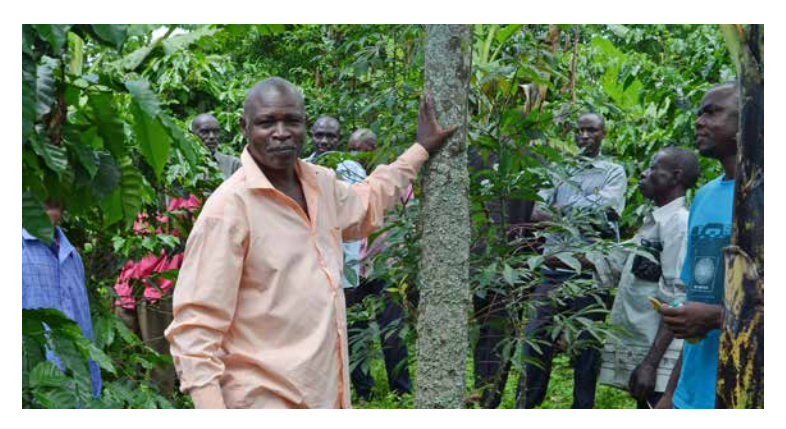
A meeting of Prunus africana farmers in Uganda.