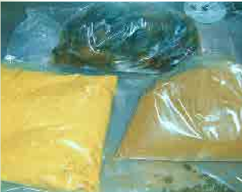
Raw material: Aloe lump (top), bitter powder (left), Lump grinded powder (right)