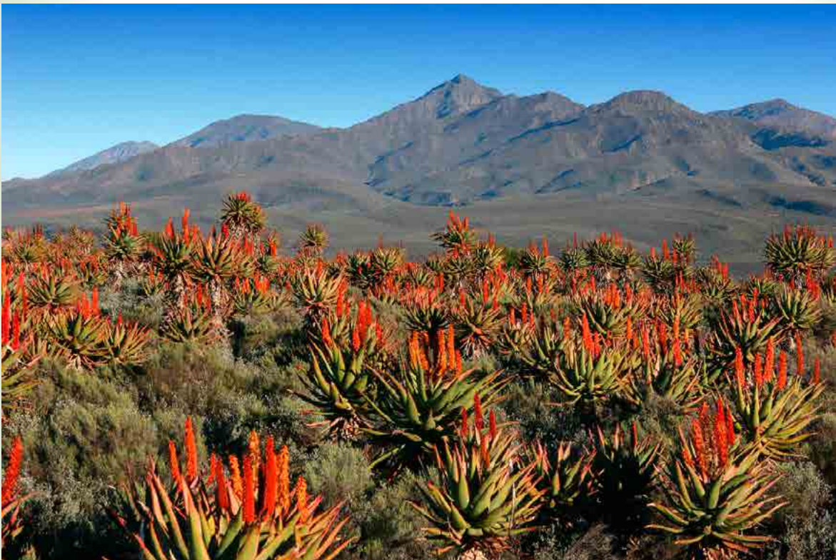
A. ferox plants in the wild at Uniondale