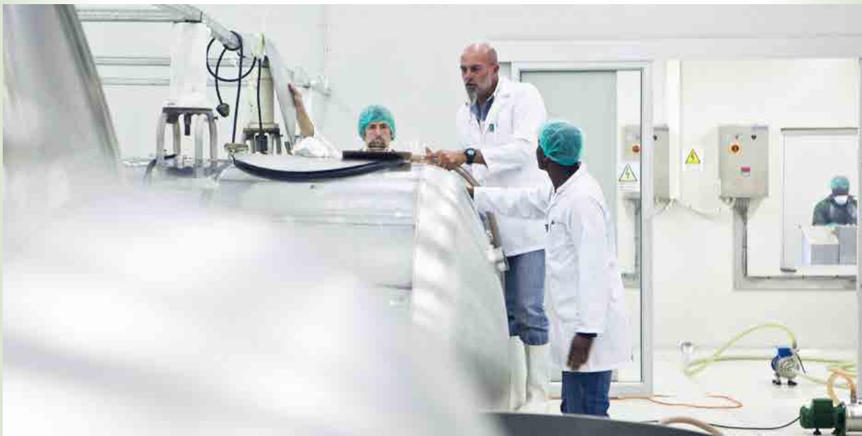
A. vera factory in Vivo, South Africa