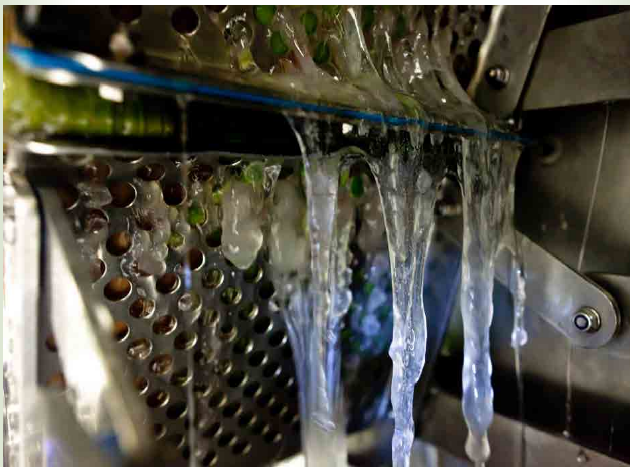
A clear juice is expressed from the A. vera leaves in the first step of processing

The next step after extracting the A. vera gel and cooling it down, is to stabilise the gel immediately to stop the enzyme and oxidation process and stop any potential bacterial or fungal activity. An enzyme could be added, like cellulase to further break down the cellulose to release the cell content. The product is systematically preserved by various optional preservatives, for example potassium sorbate, sodium benzoate, citric acid and could be combined with vitamin E. 123 Care should be taken because too much and too long enzyme activity can reduce the various polysaccharides or complex sugar chains to basic or smaller sugar molecules and this will destroy biological activity and the benefits of polysaccharides. The product could also be simultaneously heat treated with the enzymes for less than 15 minutes at 65 °C to assist in cell breakdown and pasteurisation. Alternatively, it can be enzyme treated at 50 °C for 20 minutes without loss in biological activity. 124 Various recipes exist. The gel can also be pasteurised for 1 to 2 minutes at 85 to 95 °C and then flash cooled to below 5 °C in 10 to 15 minutes. 125 Maximum stability of polysaccharides