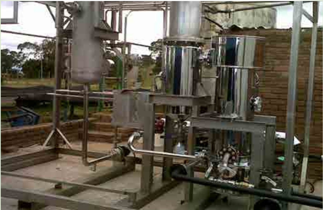
Alcohol distillation plant for producing A. ferox inner leaf gel