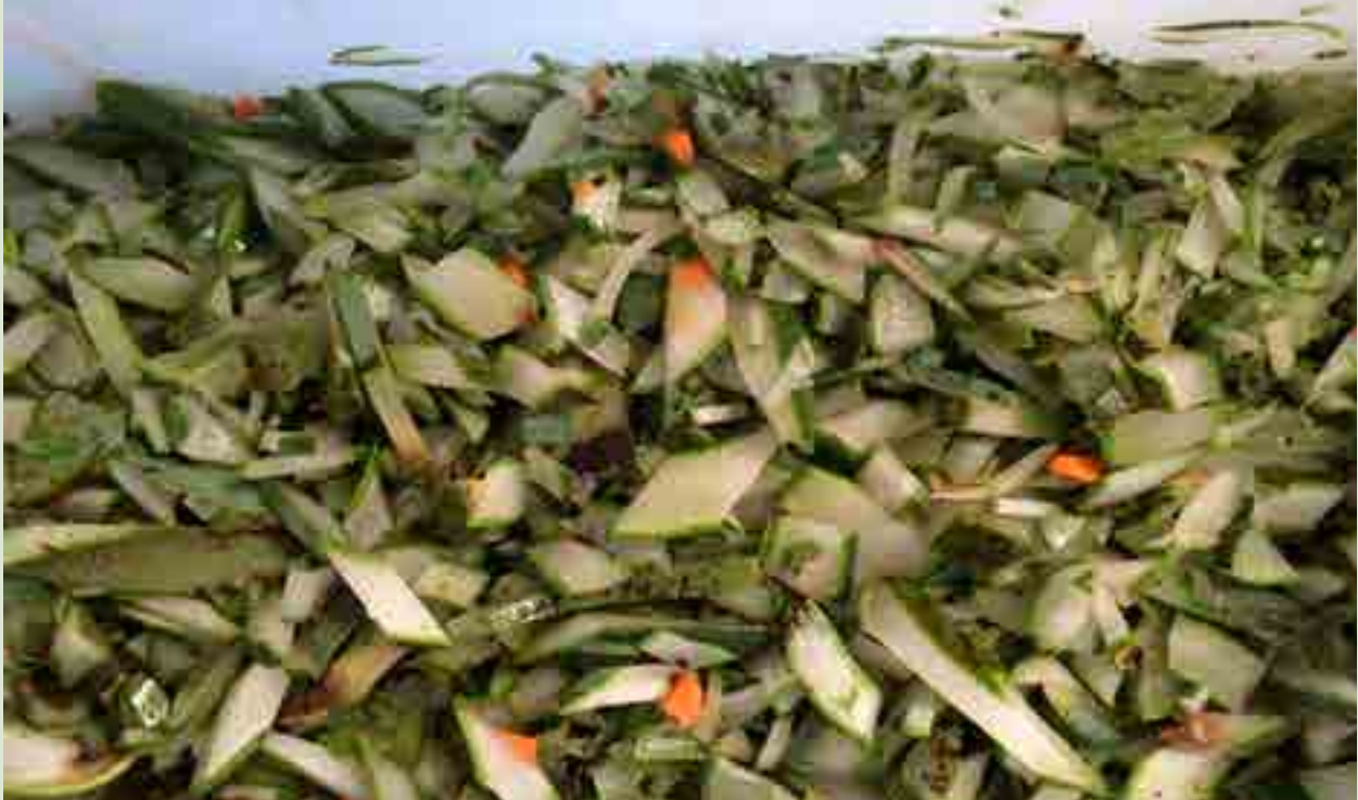
Cut pieces of A. ferox leaf for processing

count to acceptable levels. This is necessary for organic products because no other methods are available except steam sterilisation to keep bacterial counts to acceptable levels and retain all the biological activity in the whole leaf. The dried leaf is grinded and used in supplements and tea.