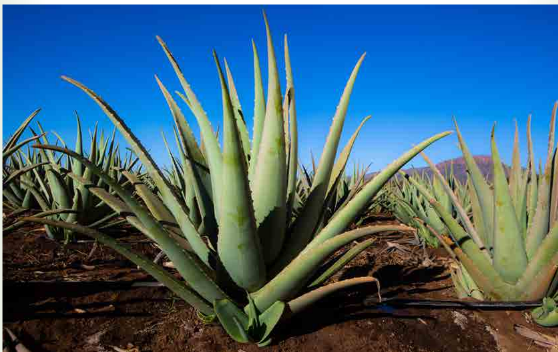
A. vera plant, South Africa

A. vera is the main species that is globally cultivated agriculturally because it yields the largest volume of inner leaf gel juice. Normally A. vera is reproduced from offshoots from the mother plant. Such offshoots could be removed twice a year. For commercial production, the identity of the plants has to be established before cultivation. Aloe species can also very easily hybridise and this could be an issue when multiple species are cultivated. The A. vera plant lasts about 8 years of commercial cultivation after which it becomes too top heavy and will topple over; then it needs to be replanted. The plant can be harvested from year two and would be a mature plant in year three.