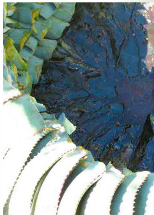
A. ferox leaves packed in a circle to drain the bitters

An A. ferox tapper tapping aloe bitters in the wild in Uniondale