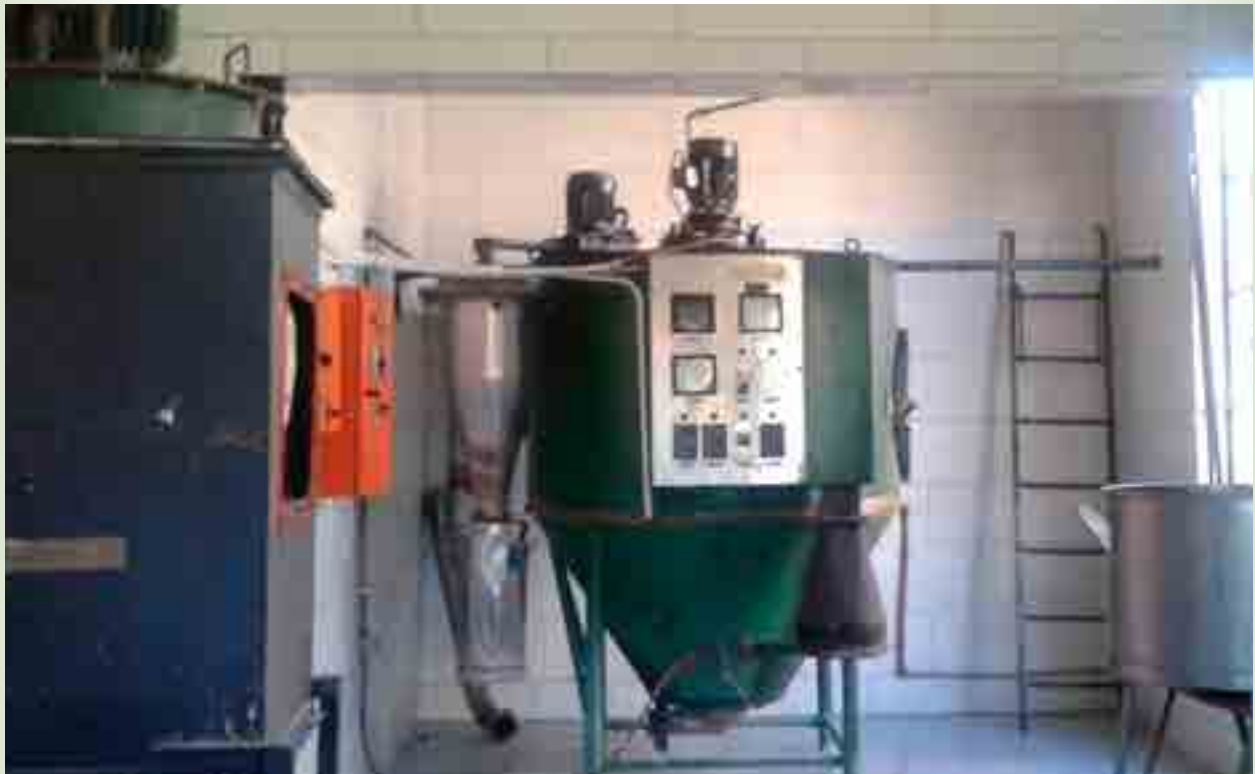
Spray dryer for spray drying aloe bitters