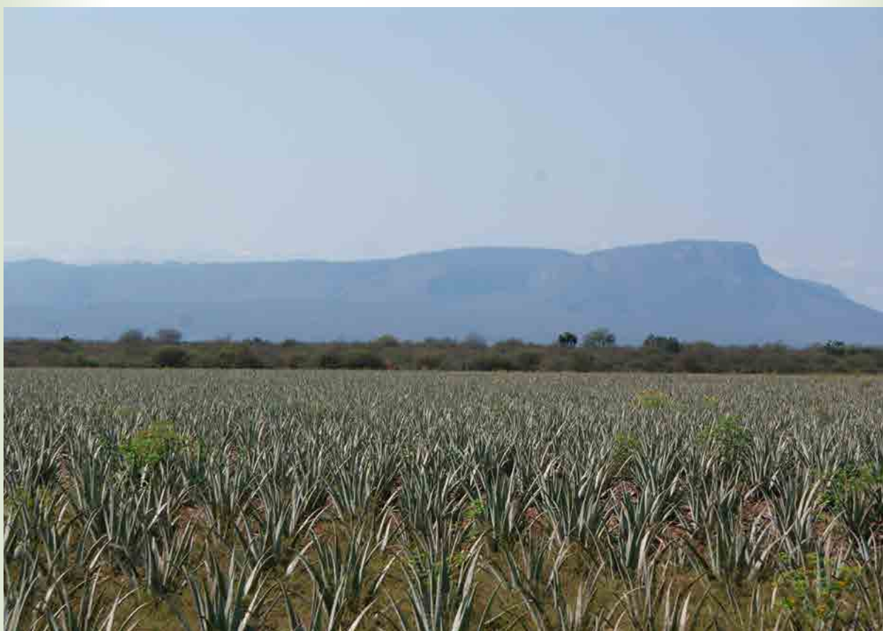
Organically grown A. vera in Vivo, South. Global labour best practices are followed.