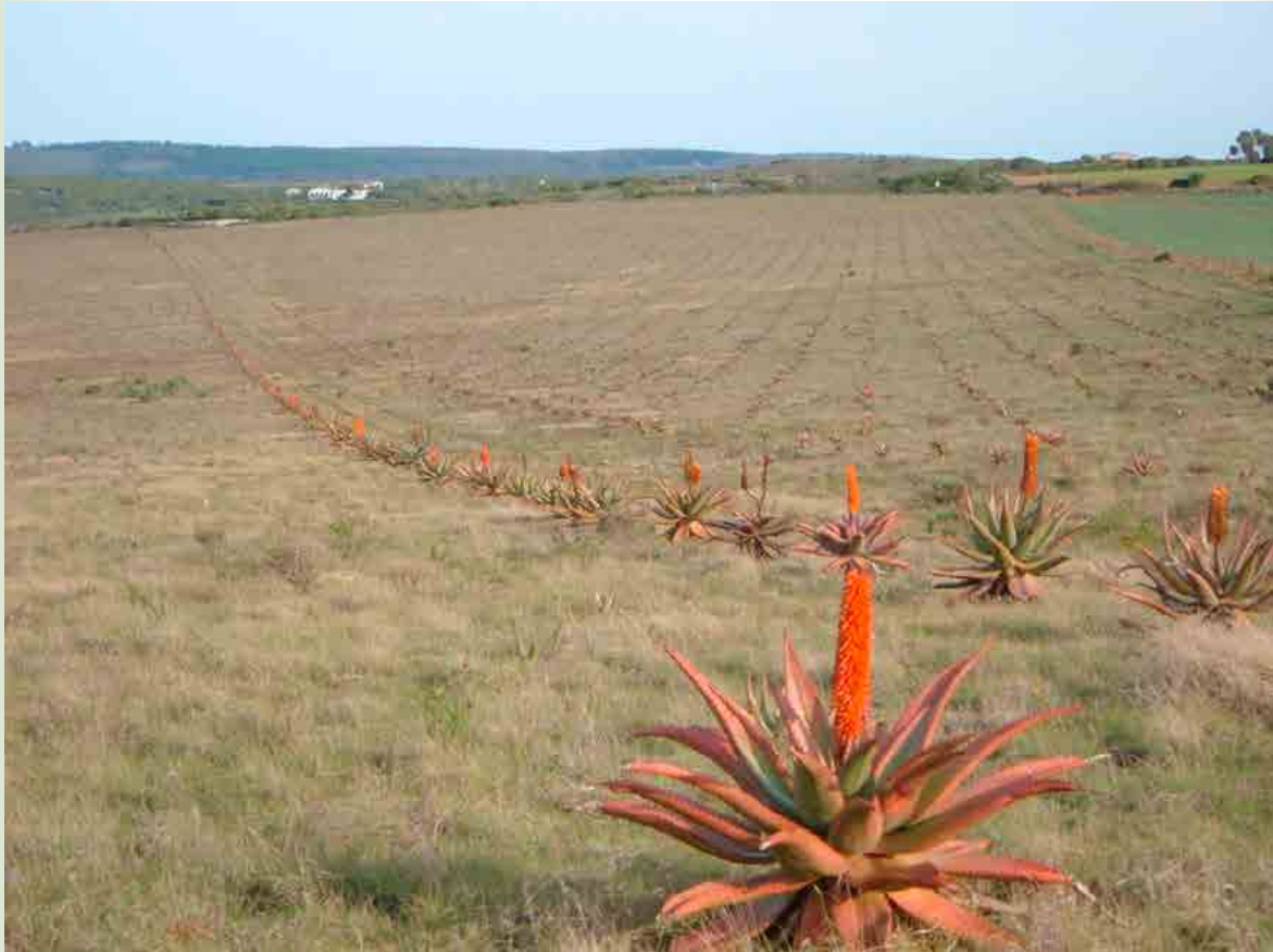
Experimental A. ferox plantation in Albertinia