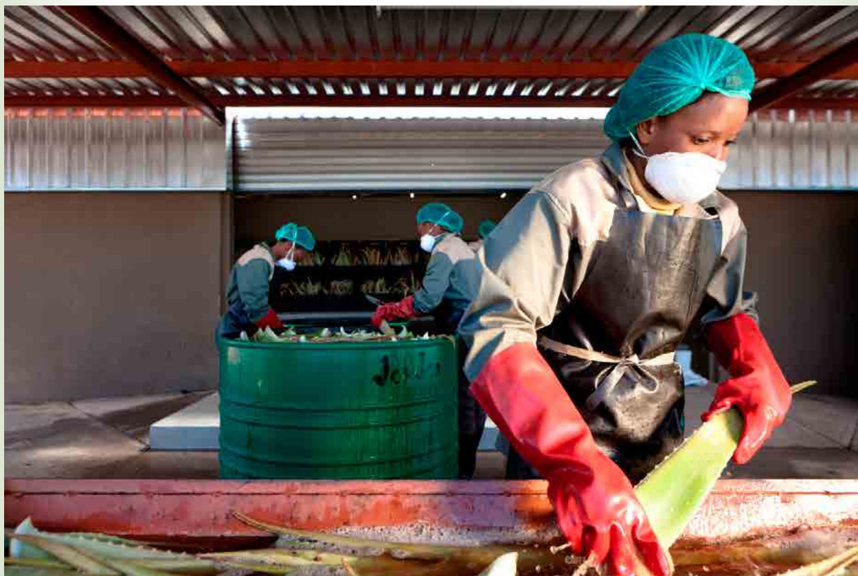
Washing of the A. vera leaves before processing