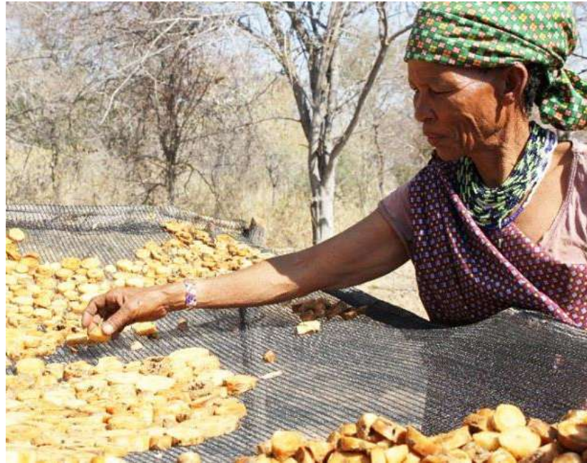
Drying on nets