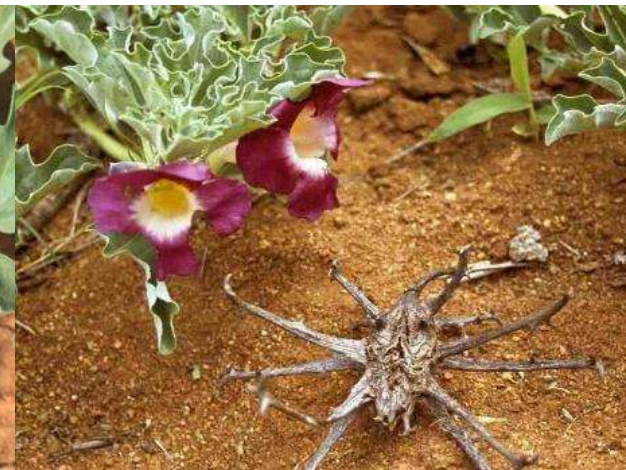
H. procumbens (photos: PL Cunningham; Wikipedia)

(Source: Wynberg 2006, after Ihlenfeldt and Hartmann 1970)