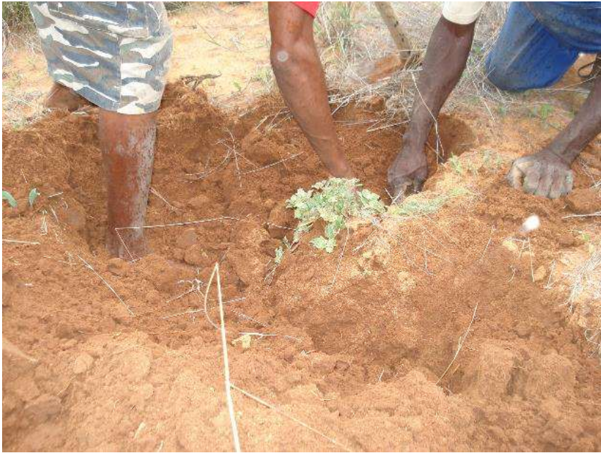
Filling the holes after collection