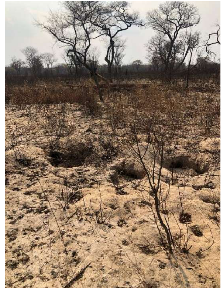
October 2021