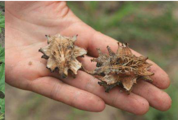
H. zeyheri