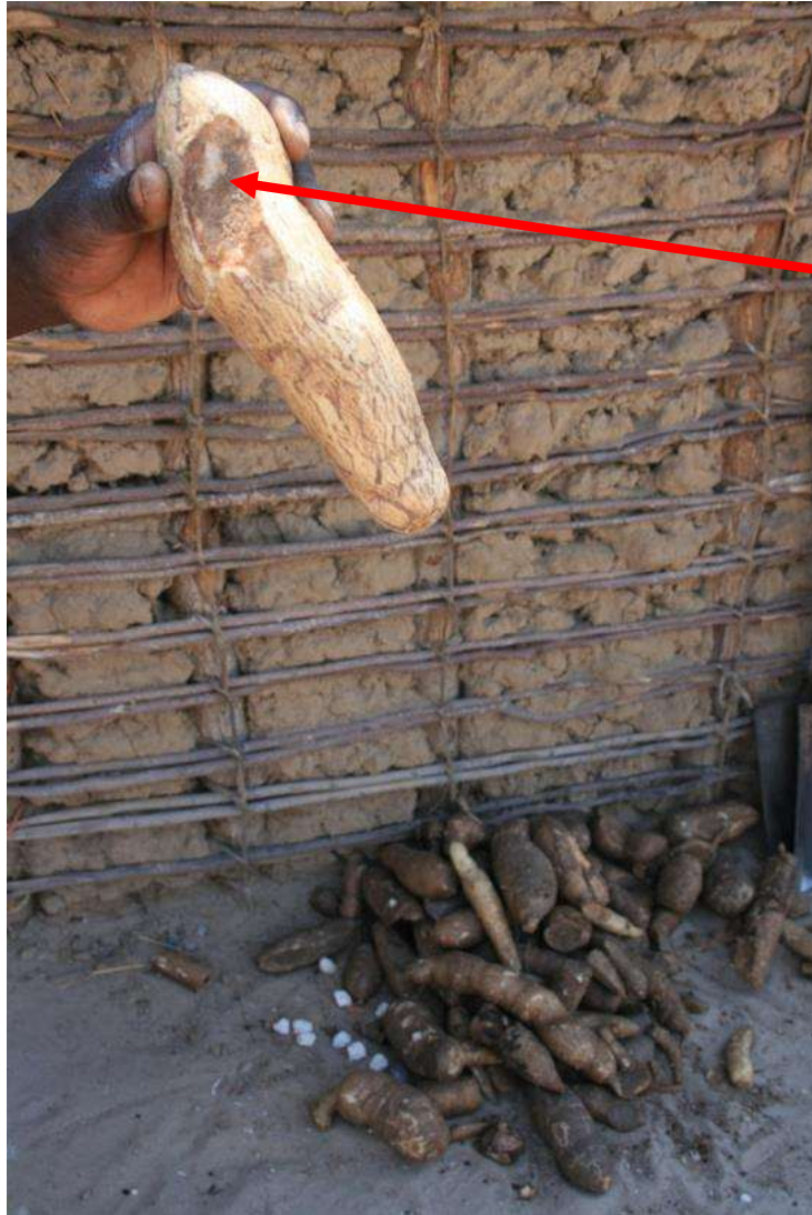
Damages caused during harvest